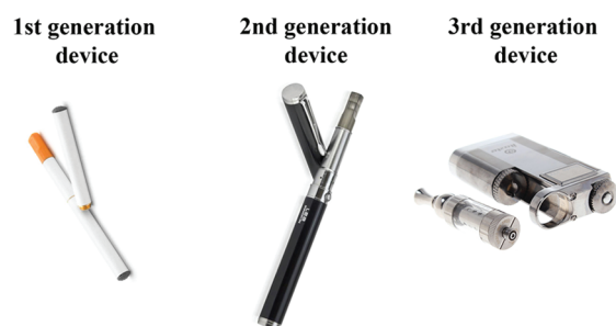
Figure 1. Examples of electronic cigarette devices currently available on the market.

consisting of very large-capacity lithium batteries with integrated circuits that allow vapors to change the voltage or power (wattage) delivered to the atomizer. These devices can be combined with either second-generation atomizers or with rebuildable atomizers, where the consumers have the ability to prepare their own setup of resistance and wick.